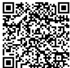
Pfizer to Pay $2.3 Billion for Fraudulent Marketing

Vaccine makers like Pfizer do not have a good track record . They have a history of putting their own profits before the health of people. They typically have to pay Billions of dollars every year to settle law suits because of pharmaceutical products that they sell or release that are harmful to humans.