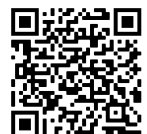
Trust the (Big Pharma) science?