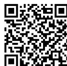
New York Times: Pfizer bribes 4500 Medical Doctors...

Do your own research on Pfizer's fraud here: https://www.nytimes.com/2010/04/01/business/01payments.html https://www.news-medical.net/news/20100401/Pfizer-admits-paying-2435-million-to-doctors-over-last-6-months.aspx https://gizadeathstar.com/2021/08/trust-the-big-pharma-science/